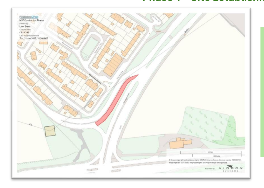
Phase 1 - Site Establishment

Following on from the consultation last year work is about to commence on an Active Travel and Capacity Improvement Scheme on Moorgate Road and the East Lancashire Road (A580) providing a fit for purpose, high quality, resilient network for the future. Works will be undertaken in different phases with later works involving Junction 4 of the M57 motorway.